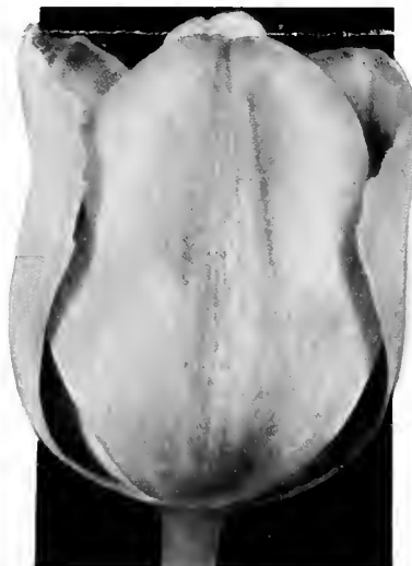
REV. H. EWBANK Per doz., 65c; per 100, $5.10; per 1000, $43.00